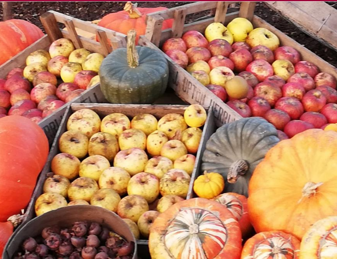
Harvest at Chartwell