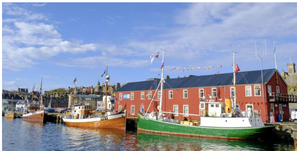
The boats in Lerwick Harbour, Shetland Islands