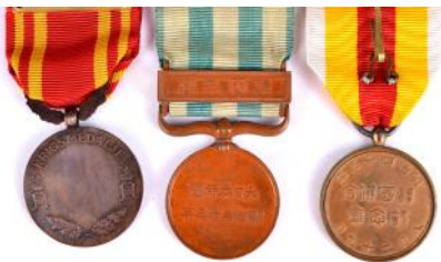
Three of the medals awarded to Lief Larsen

Leif Andreas Larsen died from a heart attack 12th October 1990.