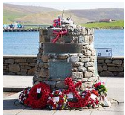
Memorial to the Shetland Bus in Scalloway