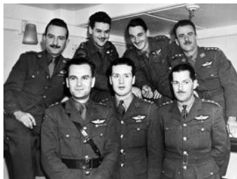
Canadian airmen at Biggin Hill. Canada's air support was crucial throughout the war.

If anyone has any information about any of the sites mentioned above, please get in touch. Or, if you know of any other local areas of historical interest that might make a good video, feel free to contact me via email on philswallow63@gmail.com