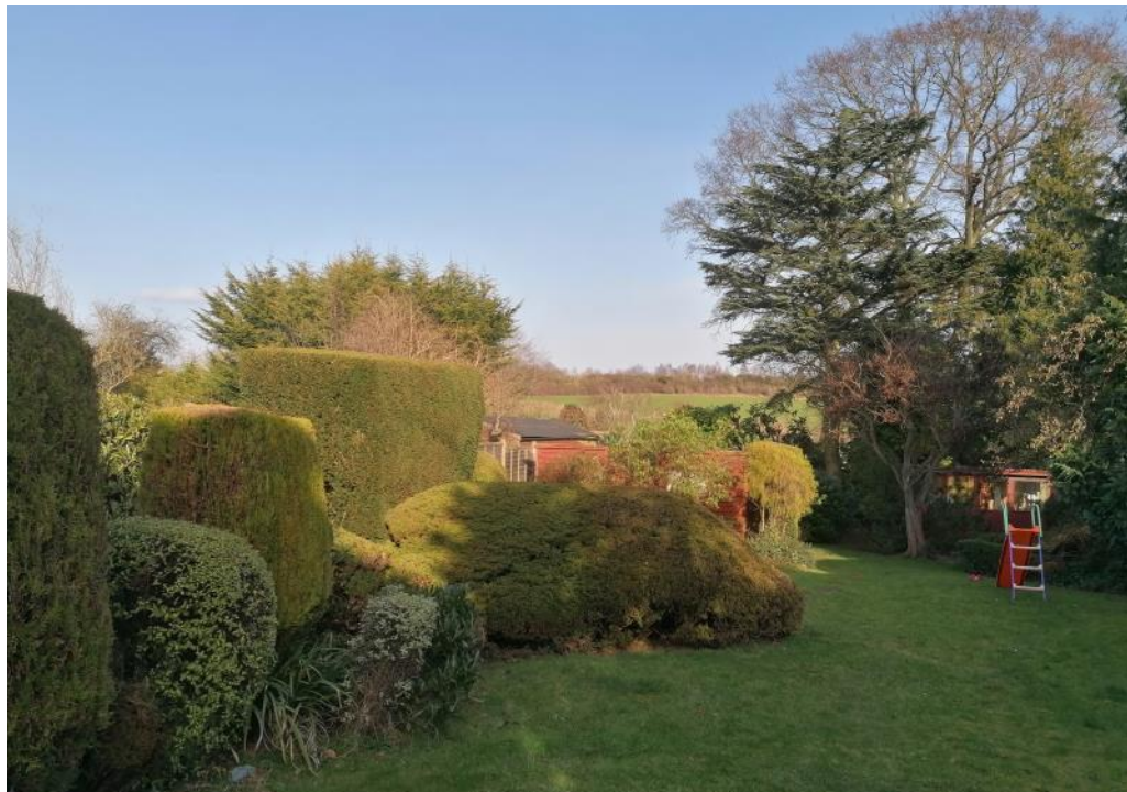
Sun and shades of green in Palace Green and across the golf course