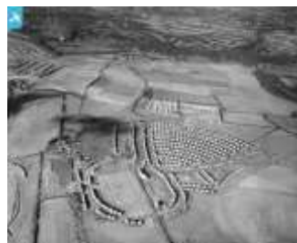
New Addington in 1946

Until the 1930s, the area now known as New Addington was farmland and woodland in the southeast of the ancient parish of Addington. The farms were called Castle Hill, Addington Lodge and Fisher's Farms . At the time, central Croydon and London had overcrowded slums causing concern to the authorities. In 1935, the First National Housing Trust purchased 569 acres of Fisher's Farm, land that had previously been Addington Aerodrome, with the intention of erecting the 'Finest Garden Village', with 4,400 houses, shops, two churches, a cinema and village green. The Chairman of the Trust was Charles Boot, hence the earliest part of New Addington is sometimes called The Boot's Estate .